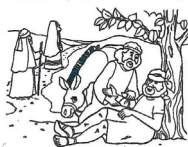
I Love Jesus! THE GOOD SAMARITAN